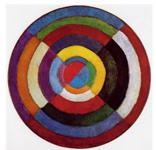
Robert Delaunay: Disque simultané , 1912/13, private collection

course followed by the actual three-year training programme. What the Bauhaus schema and Wiesner's key have in common is that both are designed as temporal sequences leading from the outside to the inside and from inside to outside, respectively. In addition, in both cases, theory and practice, and reflection and action interlock. But while the Bauhaus schema (1922) places the "building" at the centre, Wiesner has at the core the subject ("I") instead. This divergence indicates that Wiesner is not primarily concerned with the work or the product as such but with a distinct way of relating the culinary design to the subject and the relationship of the subject to the world, respectively.